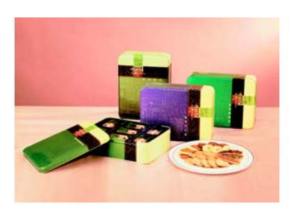
New Chinese New Year Gift Boxes