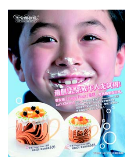
"Happy Hour" Mango and Mixed Fruit Cakes