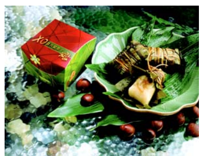
Deluxe XO Sauce Pork Floss & Chestnut Rice Dumpling